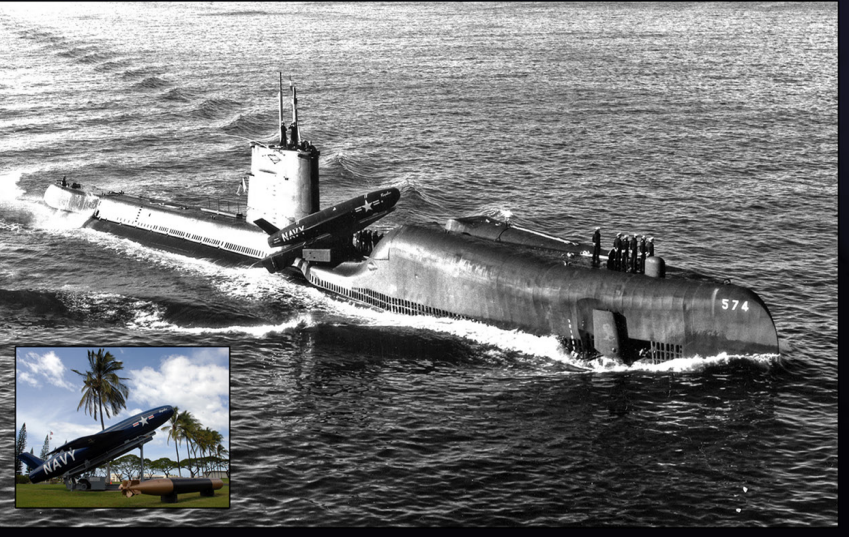
USS Grayback (SSG-574) transits the Pacific Ocean with a Regulus missile. (insert) Today, a Regulus missile sits on display at PMRF.

In 1966 following year Bonham Airfield was transferred within the Navv Department from the Commanding Officer, Naval Air Station Barbers Point to the Commander, Pacific Missile Range at Pt. Magu, Calif., and renamed the Pacific Missile Range Facility, Barking Sands. Today, PMRF is the largest instrumented multi-environment test range in the world, from space to the ocean floor.