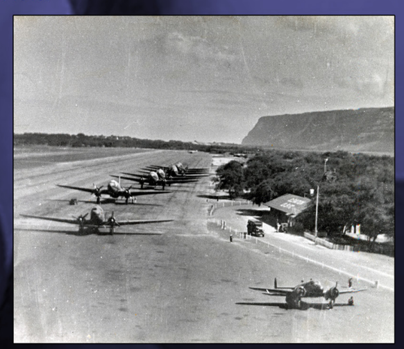
Curtiss C-46 Commandos taxi on PMRF's runway.

In 1954 the installation was officially established as Bonham Auxiliary Landing Field under Air Force jurisdiction. Four years later the first Navy instrumentation vans were positioned near the airstrip and made operational to support submarine launches of Regulus missiles. In 1964, Bonham Auxiliary Landing Field, encompassing 1,885 acres, was transferred from the USAF to the