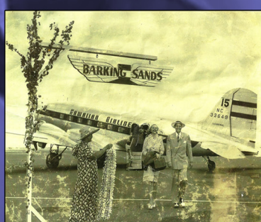
Passengers arrive from a Hawaiian Airlines flight in 1946.